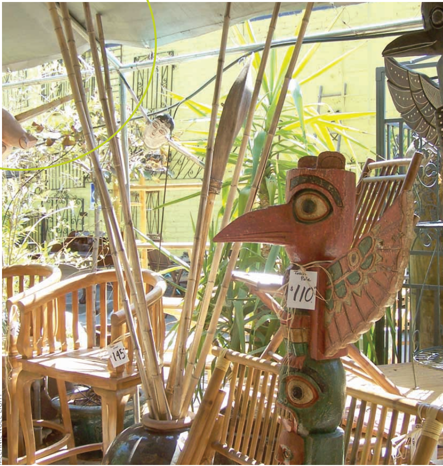
MELANIE NOEL LIGHT